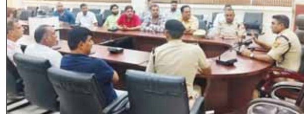
जिला सचिवालय के सभागार में होटल व गेस्ट हाउस संचालकों व पदाधिकारियों के साथ हुई बैठक